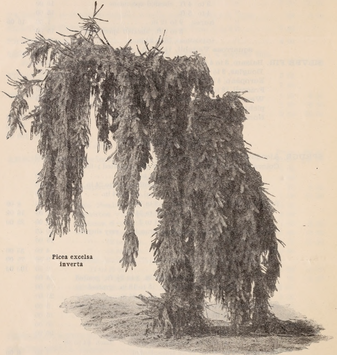
Picea excelsa inverta

The fine specimen of Picea excelsa inverta represented in the above cut is about 13 feet high and 10 feet broad. It is a thrifty plant in good condition, was transplanted in 1900, and has a fine mass of fibrous roots which retain a heavy ball of earth. It will be carefully dug and the roots mossed and the top protected with crate or burlaps and loaded on car for $75.